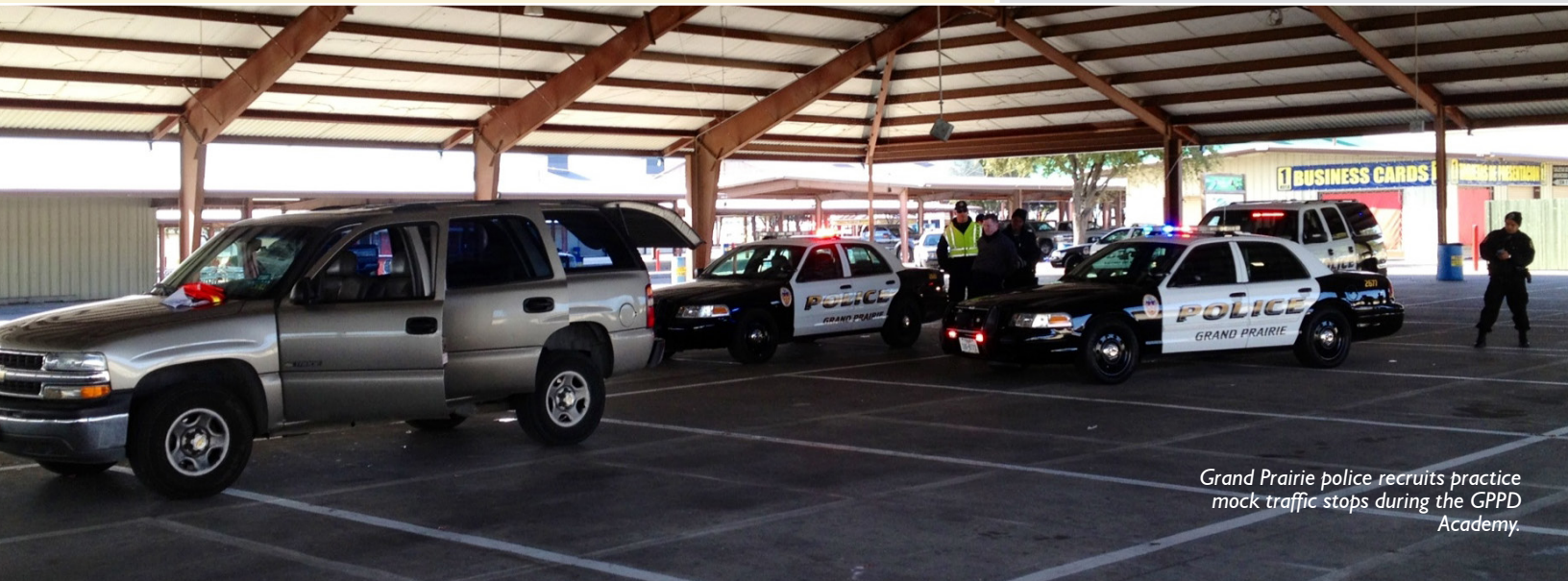
Grand Prairie police recruits practice mock traffic stops during the GPPD Academy.