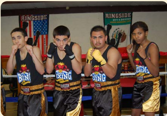
More than 30 youth ages 13 to 16 meet nearly every day with a team of volunteer coaches who not only teach participants how to box but also help students develop leadership skills to succeed in life outside the boxing ring.

Grand Prairie Police Department implemented the Unidos Program in 2012, hosting quarterly meetings geared toward improving the quality of life for Spanish-speaking residents. The community outreach program acts as a resource center for Spanish-speaking residents, providing assistance in areas of importance to the Hispanic community. Grand Prairie joins Garland, Plano, Dallas, Richardson and Rockwall as a city that uses Programa Unidos.