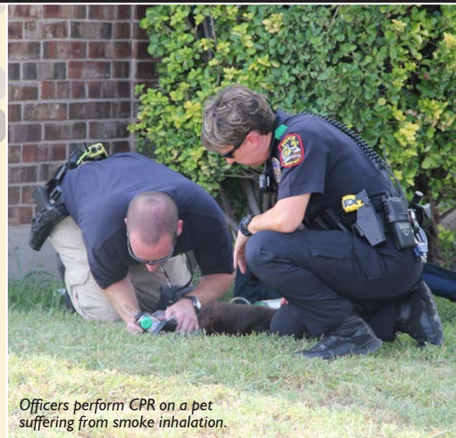
Officers perform CPR on a pet suffering from smoke inhalation.