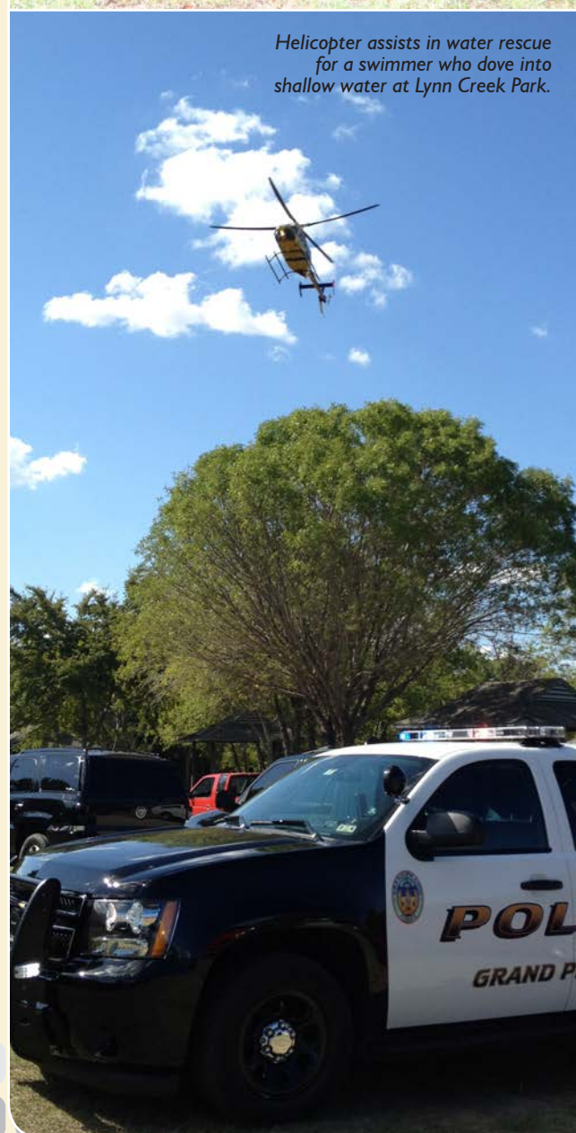
Helicopter assists in water rescue for a swimmer who dove into shallow water at Lynn Creek Park.