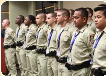
First group of recruits begin Grand Prairie Police Academy.