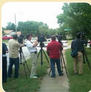
SWAT call-out May 2012