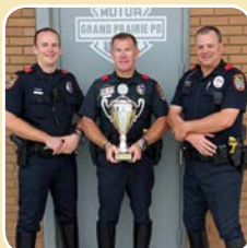
GPPD motor officers compete at 14th Annual Gulf Coast Police Motorcycle Skills Championship October 2012.