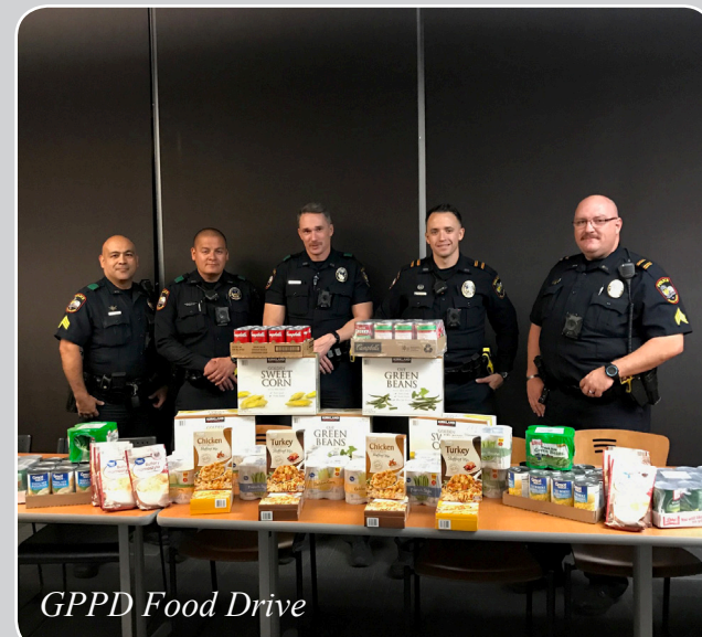
GPPD Food Drive