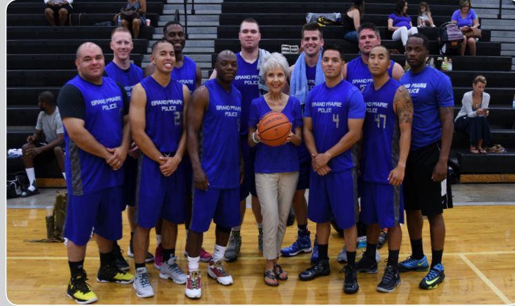
GPPD Basketball Team