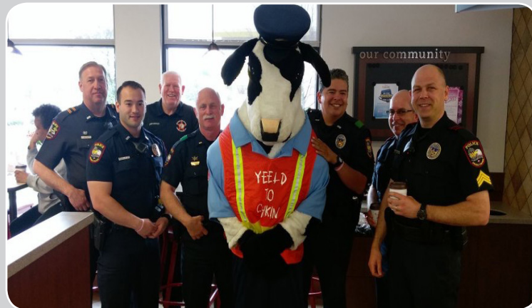
Coffee With a Cop