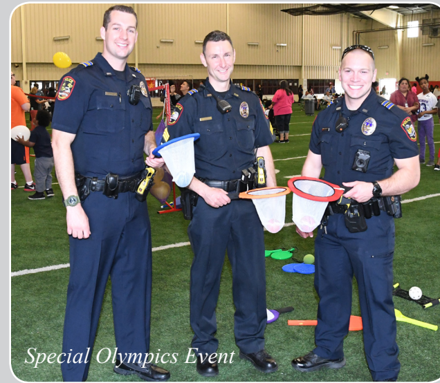
Special Olympics Event