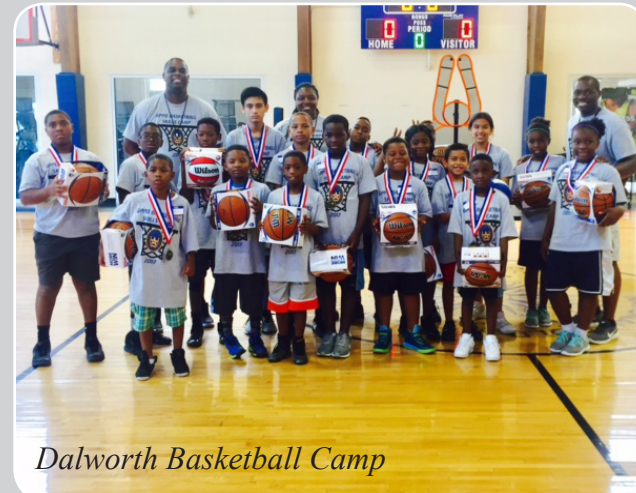
Dalworth Basketball Camp